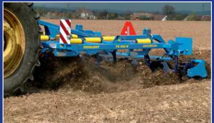
3 rows of tines ensure perfect working of the soil and mixing of plant residues.