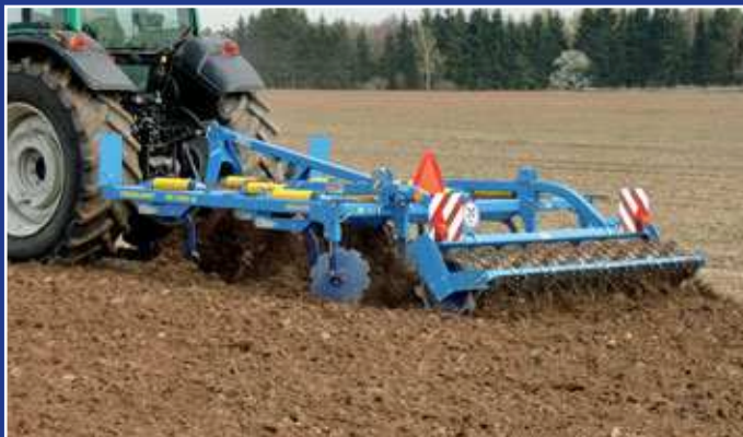
Rear segment roller for perfect breakage of clods.

Chisel points with wing for complete working of soil in lower depths.